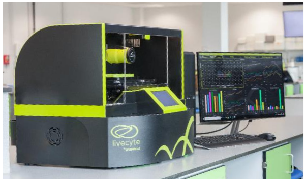
Livecyte Kinetic Cytometer

In this talk, we explore new ways to characterise cell behaviour using Livecyte. We review how simple label-free assays, in 96-well plates, can help you independently measure cell growth and cell proliferation, automatically characterise cell migration and identify other phenotypic changes. We also show Livecyte's correlative fluorescence capabilities (up to 7 channels) and how these measurements unlock additional powerful new insights.